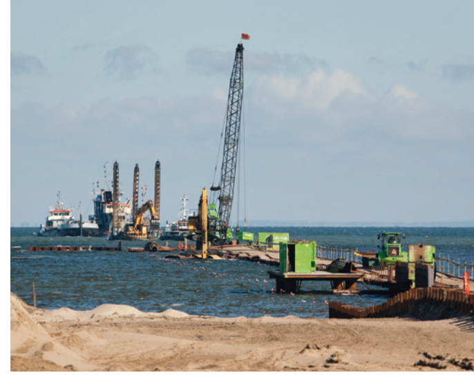
NORD STREAM Two 1,224km gas pipelines from Russia to Germany. Seabed preparation, shore approach, trenching and rock protection. Precise timing, tight co-ordination and strict environmental requirements were successfully met.

As your main contractor, we can simplify execution by managing sub-contractors and communicating with stakeholders.