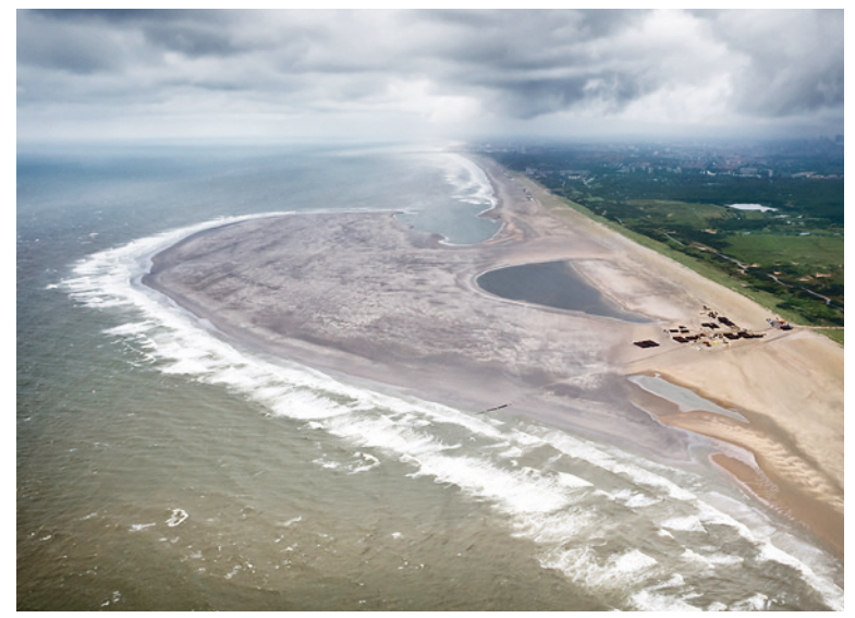
SAND MOTOR, THE NETHERLANDS The Sand Motor is one of the 'building with nature' pilot projects. It is a new innovative form of coastal defense which promotes nature development and lets natural forces such as wind, tide, currents and waves shape 21 million cubic meters of sand into new beach and dunes.

Wherever possible, we work to mitigate environmental concerns. By building with nature, we help preserve or even strenghten environmental assets without compromizing the economic benefits.