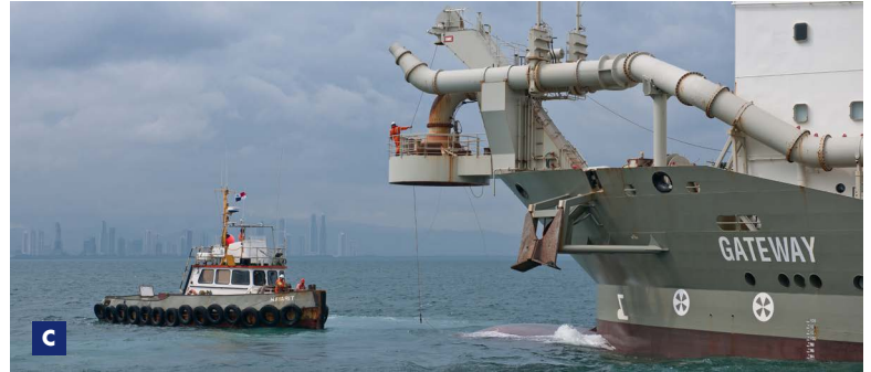
C Discharge location of TSHD Gateway D Deliverance of sand to the island

Finally, vibro compaction was used to densify the sand in order to prevent liquefaction of the sand body resulting from earthquakes.