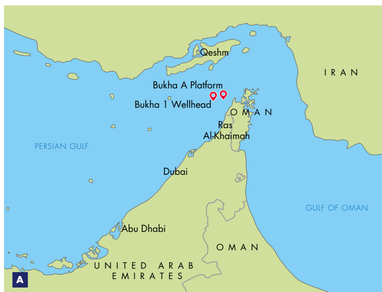
A Location map