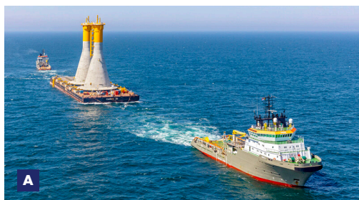
A GBS Transportation to the project site

Boskalis, in consortium with Bouygues Travaux Publics (Bouygues) and Saipem has been awarded a EUR 552 million EPCI contract for the design, construction and installation of 71 concrete Gravity-Based Structures (GBS) designed and produced as Wind Turbine Generator foundations to be installed on the Fécamp OWF site.