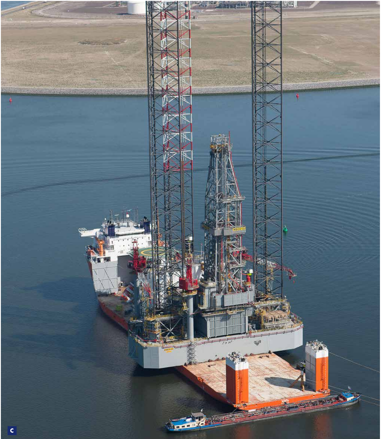
C ENSCO 122 onboard the Forte

Royal Boskalis Westminster N.V. PO Box 43 3350 AA Papendrecht The Netherlands T +31 78 69 69 000 F +31 78 69 69 555 royal@boskalis.com www.boskalis.com