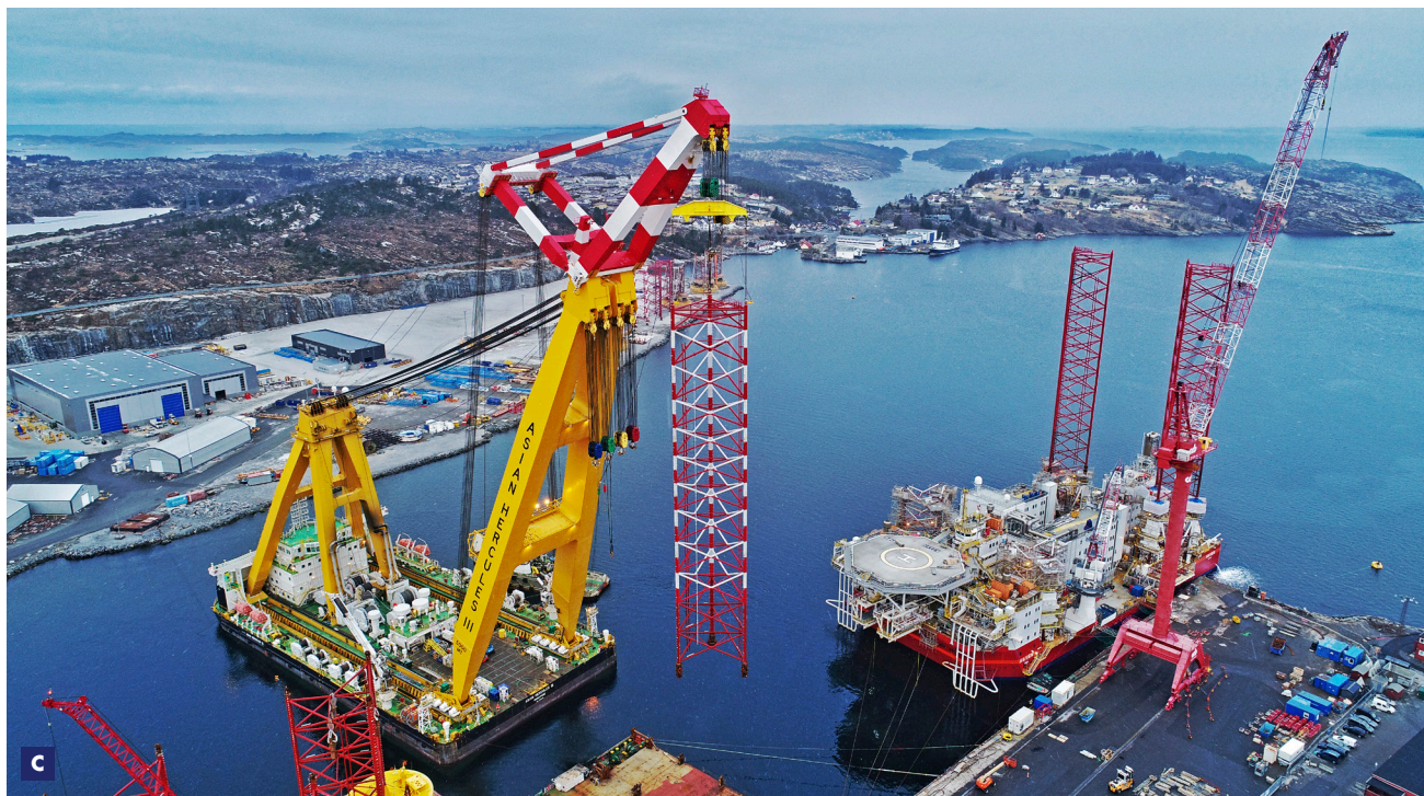
C Installation of 67m new upper leg section after upending D Ballasting suction caissons

Boskalis PO Box 43 3350 AA Papendrecht The Netherlands T +31 78 69 69 000 offshore.energy@boskalis.com www.boskalis.com/offshore