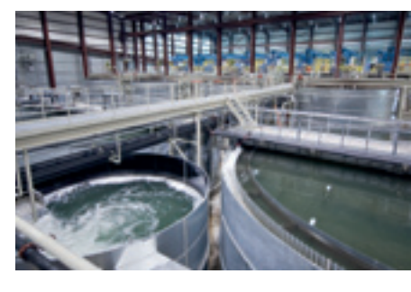
CONTAMINATED DREDGED SEDIMENT MANAGEMENT