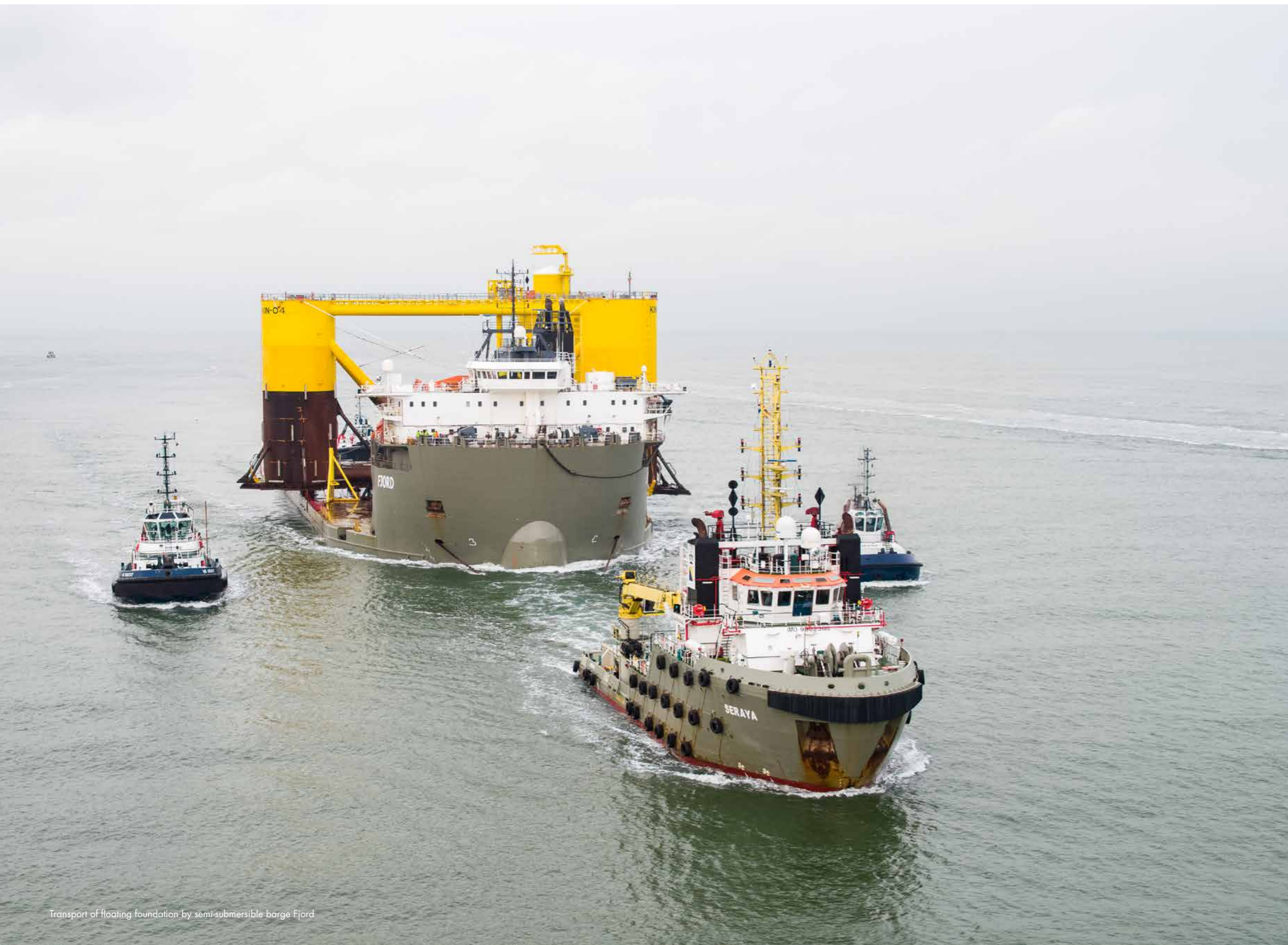
Transport of floating foundation by semi-submersible barge Fjord