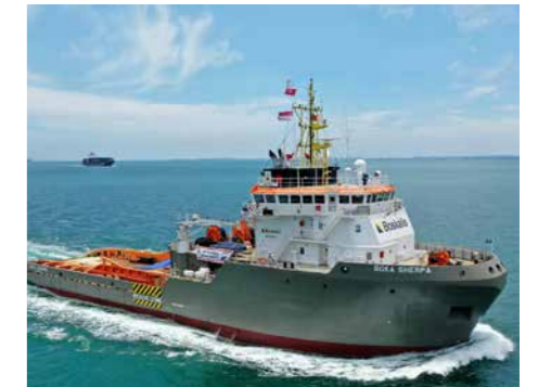
5 OCEAN TOWAGE TUGS