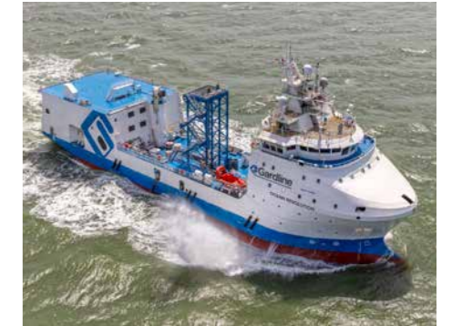
15 SURVEY VESSELS