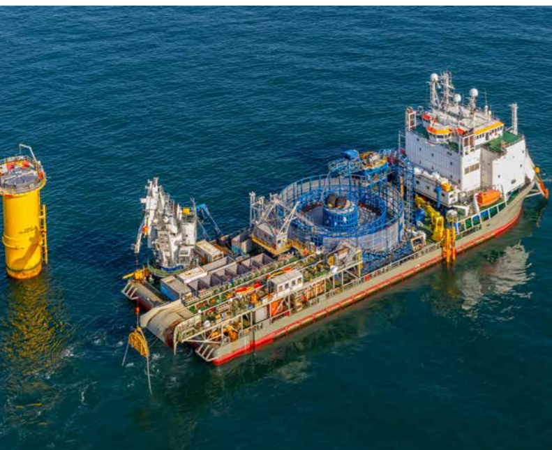
Cable laying operation by cable laying vessel Spirit

We use air diving, saturation diving and an owned fleet of dive support and ROV support vessels and mission equipment to provide subsea inspection, repair and maintenance service for offshore wind projects. We offer total solutions based on fully-equipped diving support vessels and modular dive spreads, in-house project management and engineering, and management of our own ROV equipment, ranging from inspection class to full work class systems.