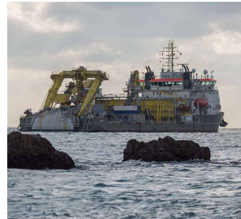
Cable repair operations