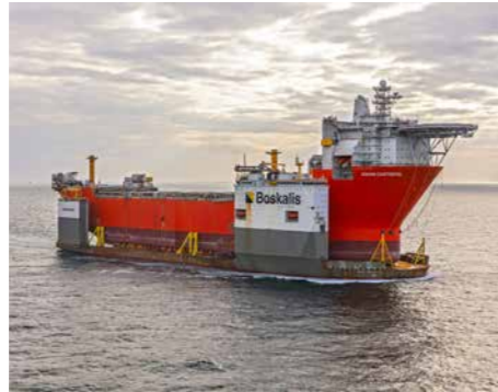
11 SEMI-SUBMERSIBLE HEAVY TRANSPORT VESSELS