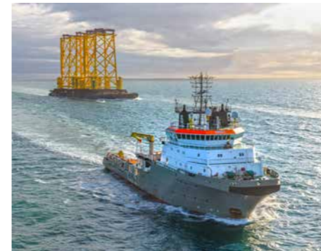
15 ANCHOR HANDLING TUGS