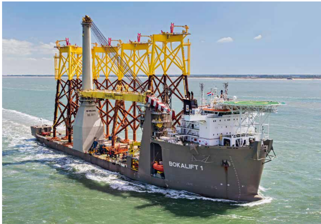
Transport and installation of jacket foundations by crane vessel Bokalift 1

Before installing Gravity Based Structures (GBS) the seabed needs to be prepared by installing a gravel bed. This will ensure stability and accurate positioning of GBS. To ensure the structure remains safe in even the harshest weather conditions, we are able to develop and install a solid ballast solution, including solutions for floating wind foundations. We can offer a total solution; we manage the procurement of the material, the loading of the fallpipe vessels as well as the transport and installation of rock to reduce our client's interfaces.