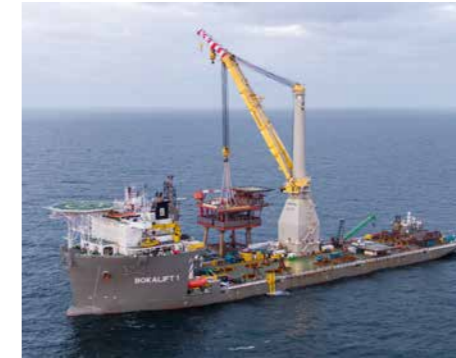
2 HEAVY LIFT VESSELS