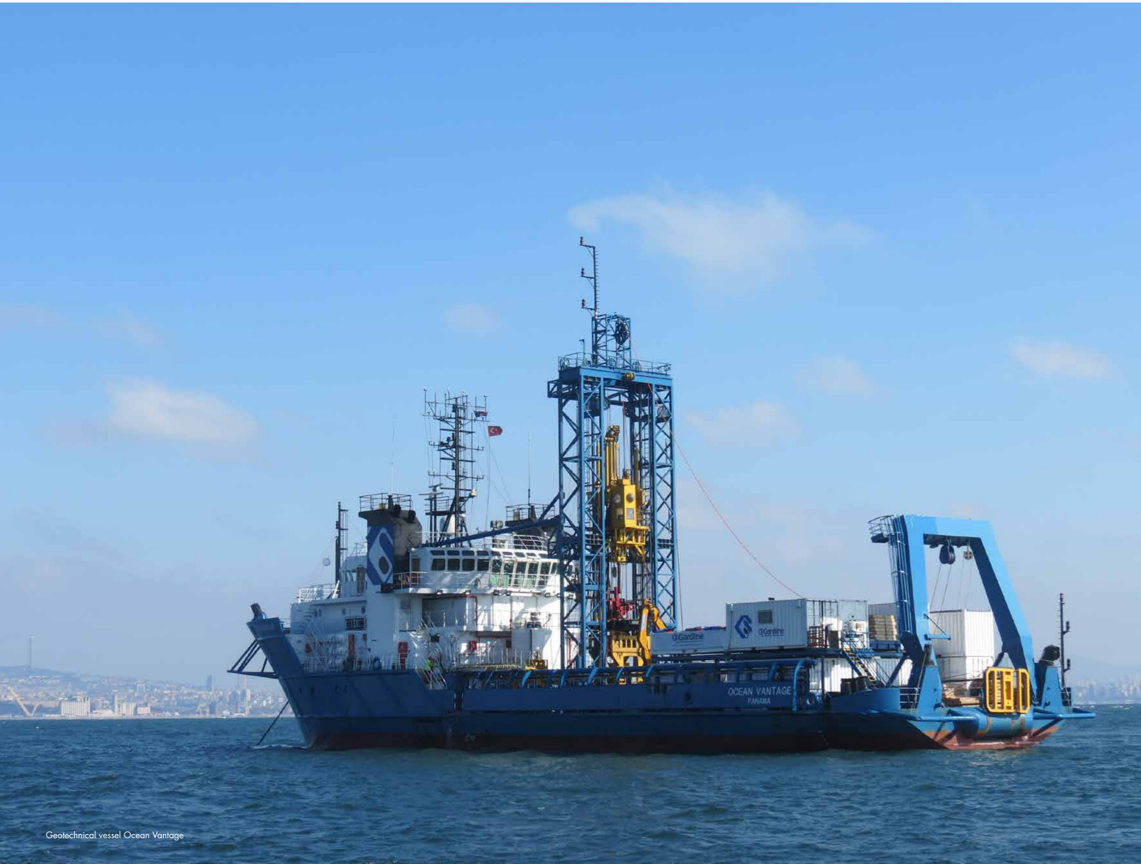
Geotechnical vessel Ocean Vantage

'THE WHOLE PACKAGE TO PREPARE THE SEABED; FROM SURVEY TO UXO- AND BOULDER CLEARANCE'