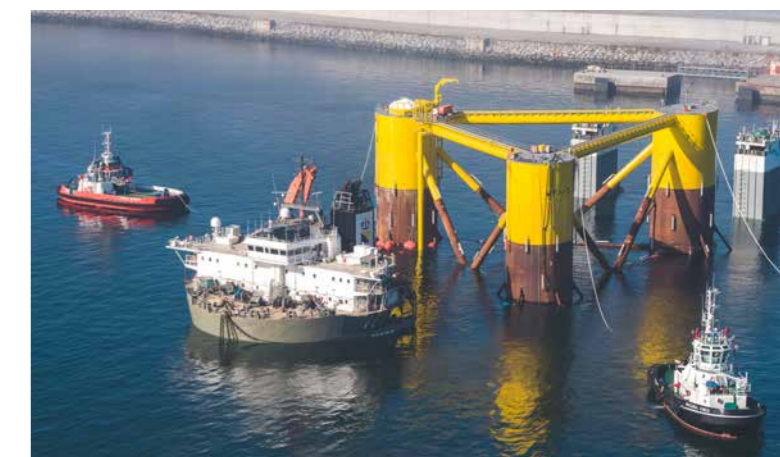
Floating foundation being submerged by semi-submersible barge Fjord

For world's largest floating offshore wind farm, Kincardine, we have been contracted as Transport and Installation contractor. We are responsible for the transport of all floating foundations from the fabrication yard to the integration yard, the mooring installation, load-out and float-off of the floating foundation and the towage and hook-up of the floating turbines in the field.