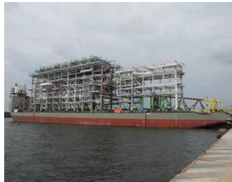
2 SEMI-SUBMERSIBLE OCEANGOING BARGES