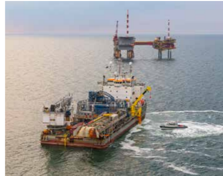
4 CABLE-LAYING VESSELS AND BARGES