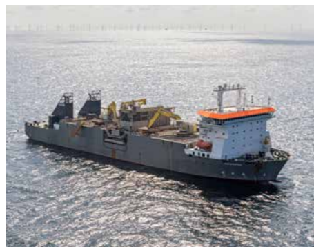
3 SUBSEA ROCK INSTALLATION VESSELS