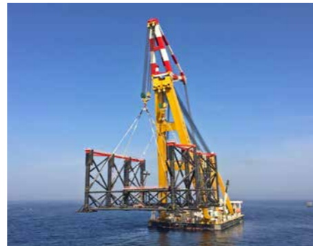
4 FLOATING SHEERLEGS AND CRANE BARGES