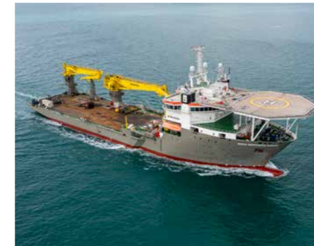
7 CONSTRUCTION SUPPORT VESSELS