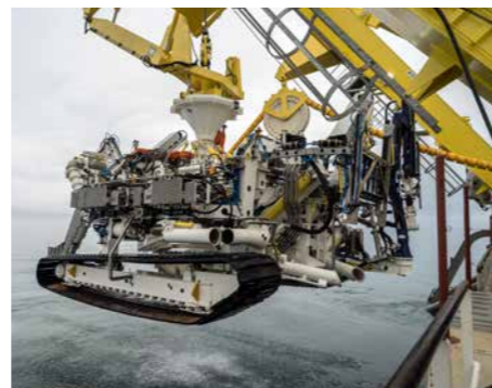
6 TRENCHING EQUIPMENT