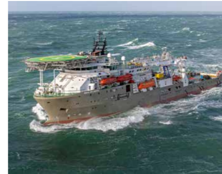
5 DIVING SUPPORT VESSELS