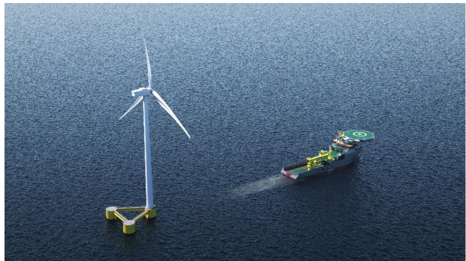
Artist's impression of a floating wind turbine being towed by a Boskalis anchor handling tug