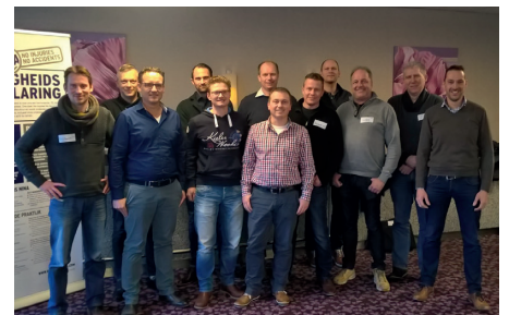
| NINA Refresher at specialised department for Raw Materials, BKN

Taking time for safety together with your team (again). That is the idea behind a NINA Refresher. In January, the specialised department for 'Raw Materials' organised a session.