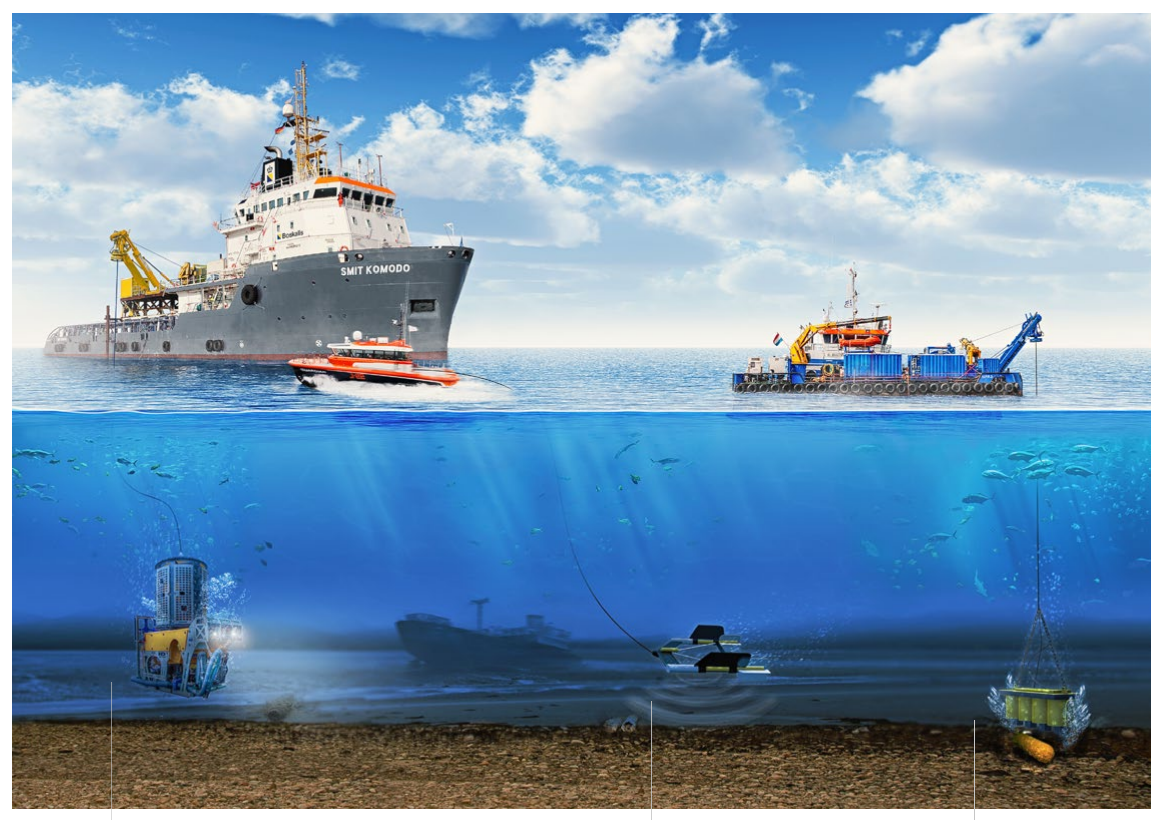
Heavy-Duty Work Class Remotely Operated Vehicle (HD-WROV) for locating and salvaging ammunition

Safety always comes first, particularly when controlled demolition is involved. Our certified disposal experts are licensed to detonate ammunition on site using measures developed by our own company. We ensure that our people and the surrounding natural environment are protected using techniques such as bubble curtains placed around the target object.