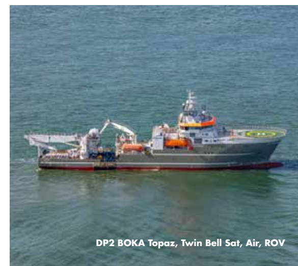
DP2 BOKA Topaz, Twin Bell Sat, Air, ROV