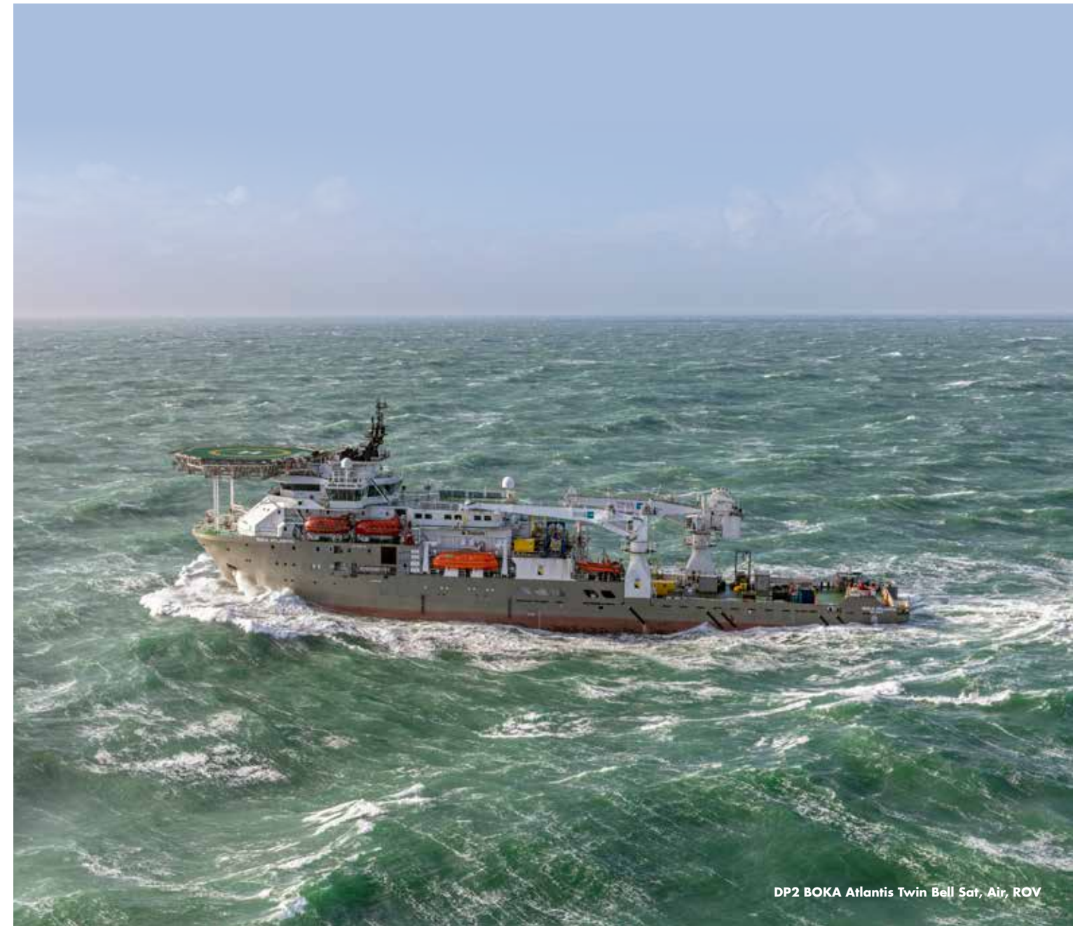
DP2 BOKA Atlantis Twin Bell Sat, Air, ROV