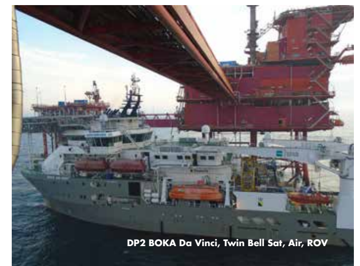
DP2 BOKA Da Vinci, Twin Bell Sat, Air, ROV