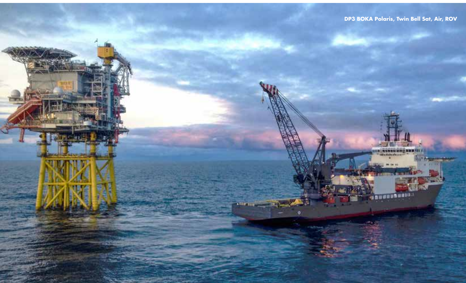
DP3 BOKA Polaris, Twin Bell Sat, Air, ROV