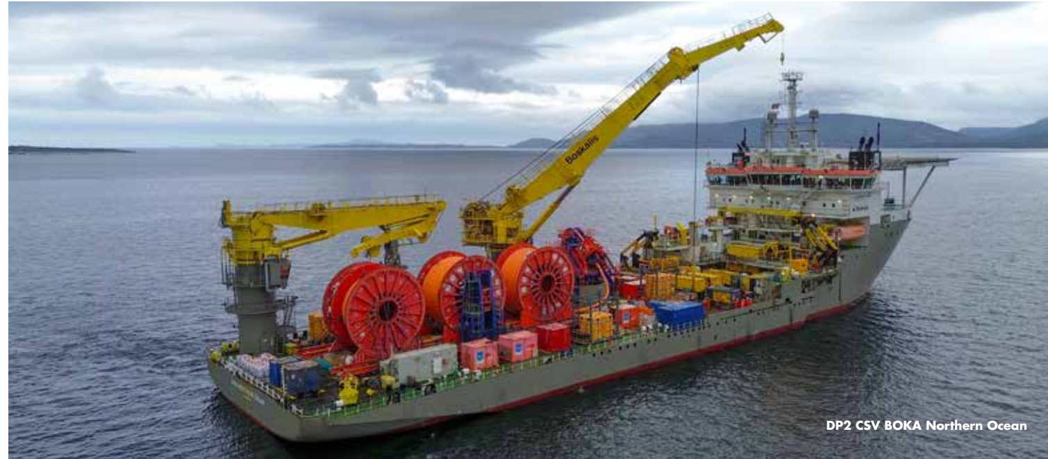
DP2 CSV BOKA Northern Ocean

To support our subsea services activities we have the following Diving Support Vessels (DSVs) and Construction Support Vessels (CSVs) in our owned fleet or on long term charter.