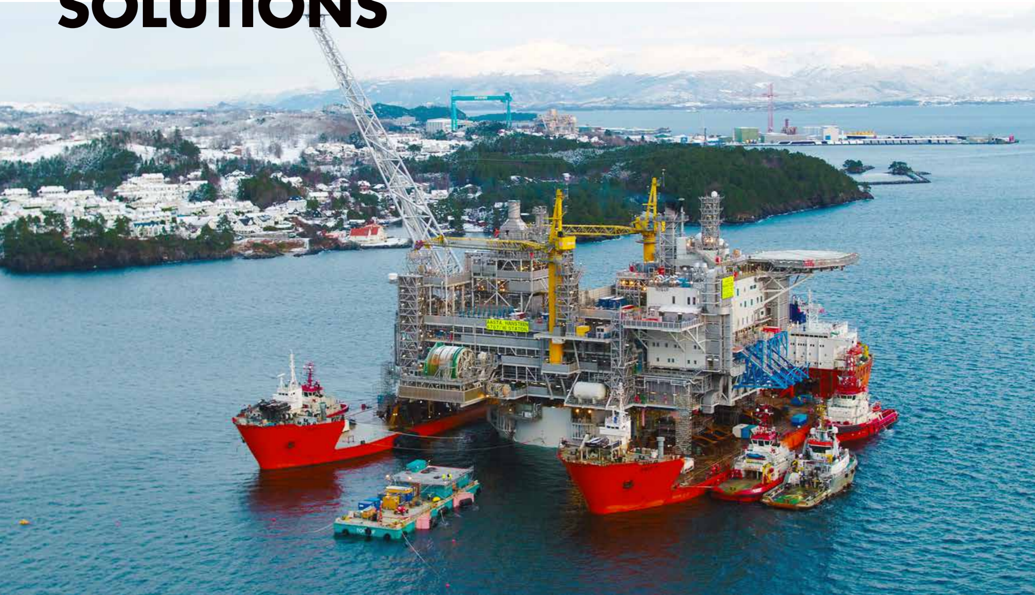
Aasta Hansteen: Topside float-over installation with the top of the SPAR hull above the waterline in between the S-class vessels, Norway.

'BOSKALIS HAS THE RESOURCES TO BUILD A GLOBAL TEAM AROUND THE CHALLENGES YOU FACE'