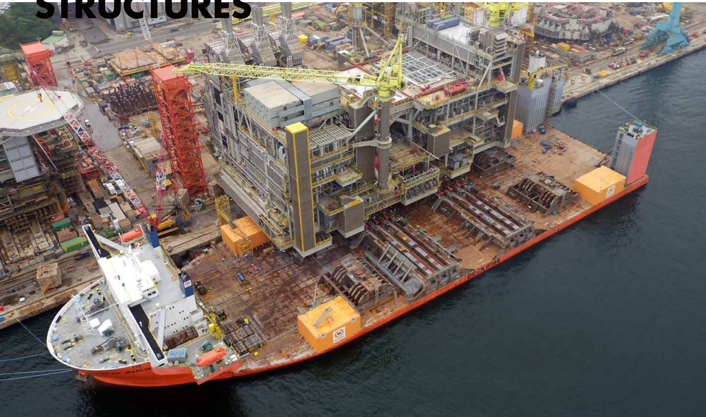
ULSAN – SOUTH KOREA Skidded load-out of the 42,000t Hebron Utilities Process Module on board the Blue Marlin.